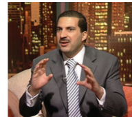
Hajj Amr Khaled LifeMakers

Mindful of Allah's tests for all of us, we invite you to reflect, in the light of the practical suggestions contained within this guide, and see how being mindful of our impact on climate change will help us all to be more observant Muslims, and make our actions pleasing to Allah. Try these practical suggestions with your family and friends. Invite others to join with you and see how you can save energy, resources, time, money and most of all, save the precious balance in this world for your children and the generations to come, inshAllah.